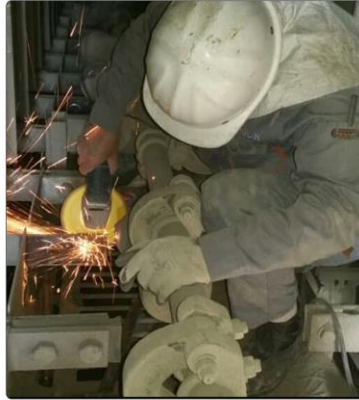
Repairing rapping systems