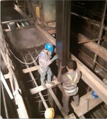
Collecting plate replacement